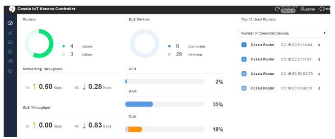
Figure 2 – Cassia IoT AC Dashboard

The dashboard displays real-time data in the current state, including: Throughput, System, Routers connected, end devices connected, and Top 10 Used Routers (see Figure 2).