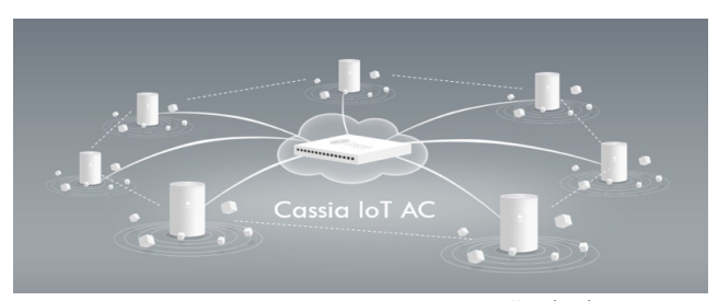
Figure 1 - Cassia IoT Access Controller (AC)

From office to the factory floor, from sports arenas to hospitals, Cassia's Bluetooth IoT is changing many industries. Together, Cassia's IoT AC and Bluetooth routers deliver new enterprise Bluetooth IoT applications to new environments.